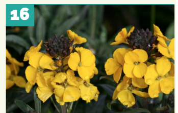
Wallflower (many colours)