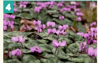
Cyclamen (also in white)