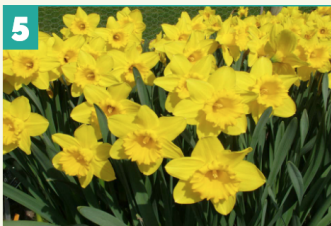
Daffodil (also in white or cream)