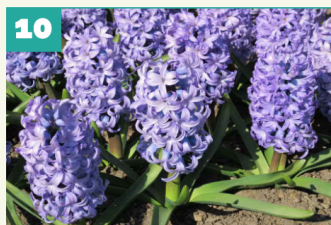
Hyacinth (many colours)