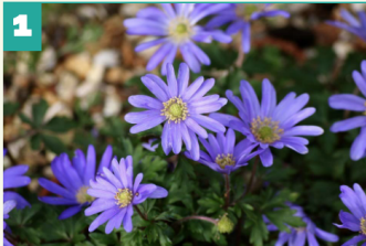
Anemone (also white)